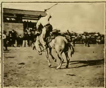
BOSLER PET IN ACTION.